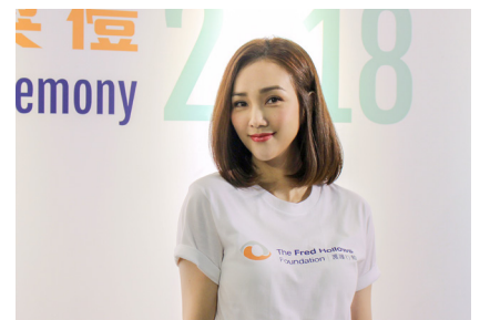
PHOTO EXHIBITION TO MARK OUR 25TH ANNIVERSARY

To celebrate the 25 years of work by The Fred Hollows Foundation in 25 countries, we did some digging around and found some amazing images that capture the raw emotion and humanity behind our work. Stay up to date with our latest photo exhibition calendar at our Facebook page.